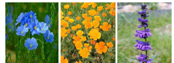
Blue Flax Poppy Penstemon

All suggested rates are for broadcast method and are determined by soil condition, soil preparedness, and planting purpose.