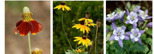
Cornflower Black-eyed Susan Blue Columbine