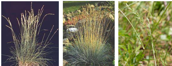
Streambank Wheatgrass Sheep Fescue Ryegrass

BN = Bunch-forming, Native SN = Sod-forming, Native BI = Bunch-forming, Introduced SI = Sod-forming, Introduced